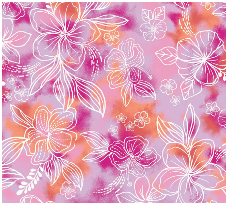
MC632 | HELLO HIBISCUS (HOHI) SIZE: XS-3XL FABRIC: 94% Polyester, 6% Spandex