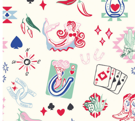
MC632 | LADY LUCK (LDLU) SIZE: XS-3XL FABRIC: 94% Polyester, 6% Spandex