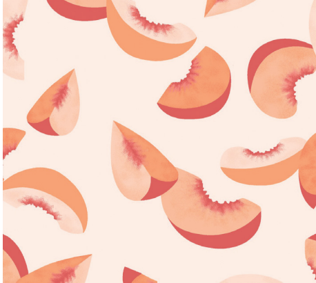
MC8564 | JUST PEACHY (JSPY) SIZE: XS-3XL FABRIC: 94% Polyester/ 6% Spandex