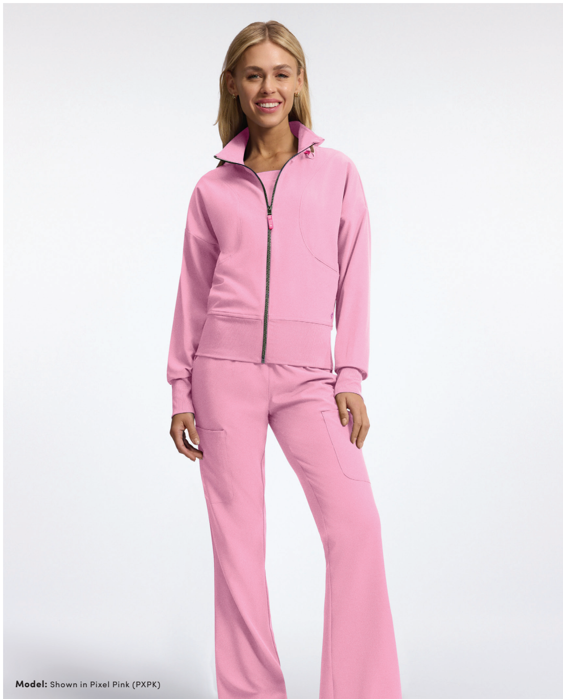
Model: Shown in Pixel Pink (PXPK)