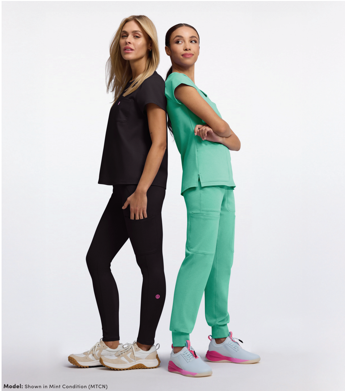
Model: Shown in Mint Condition (MTCN)