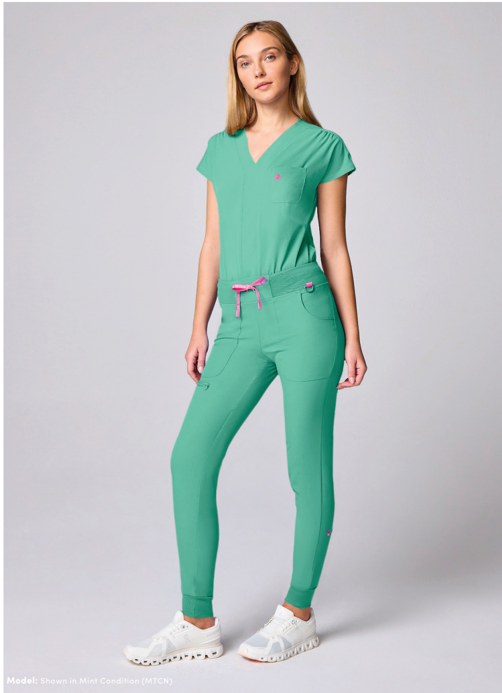
Model: Shown in Mint Condition (MTCN)